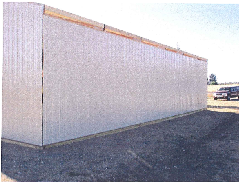
West side looking southeast