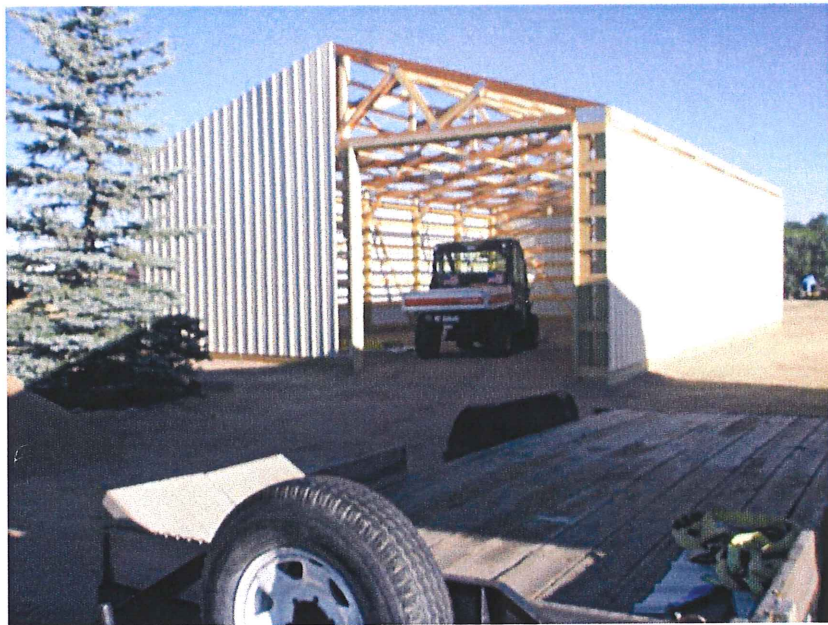
South end looking northwest