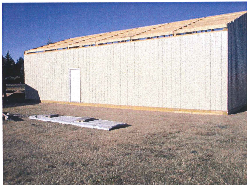
East side looking southwest